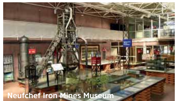
Neufchef Iron Mines Museum