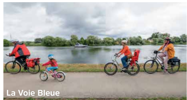
La Voie Bleue