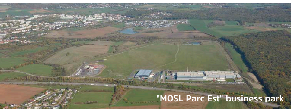
"MOSL Parc Est" business park