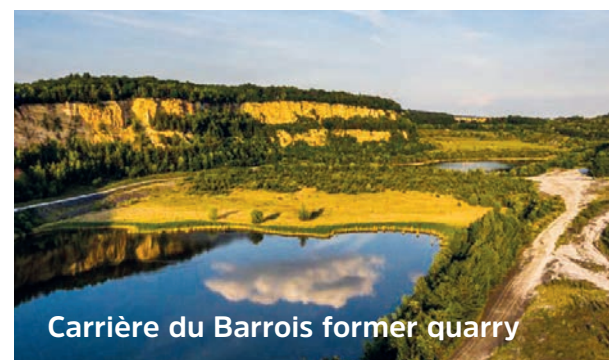
Carrière du Barrois former quarry