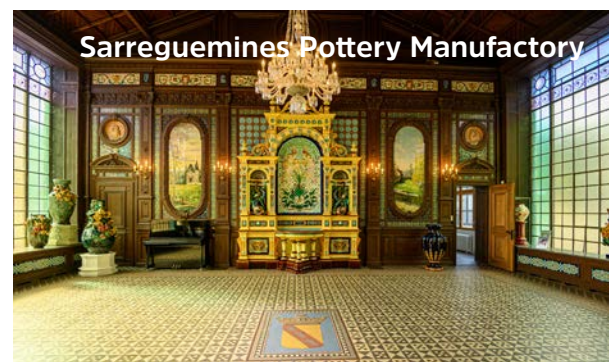
Sarreguemines Pottery Manufactory