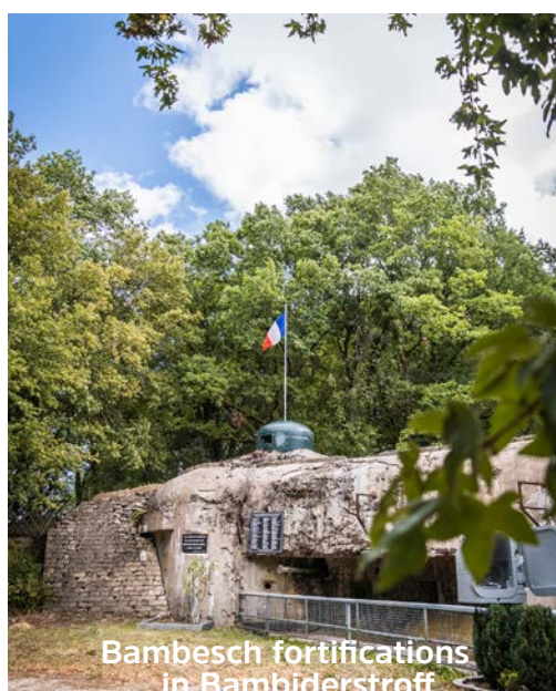
Bambesch fortifications in Bambiderstroff