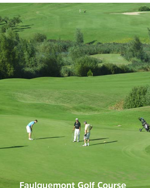
Faulquemont Golf Course