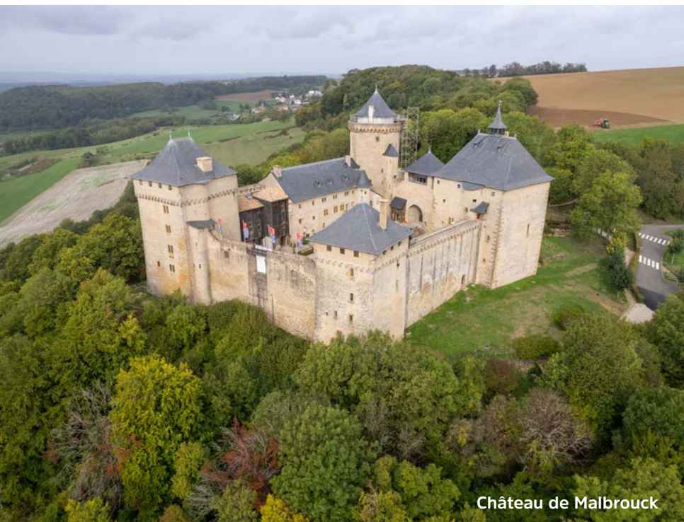
Château de Malbrouck