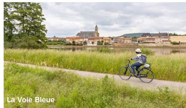
La Voie Bleue