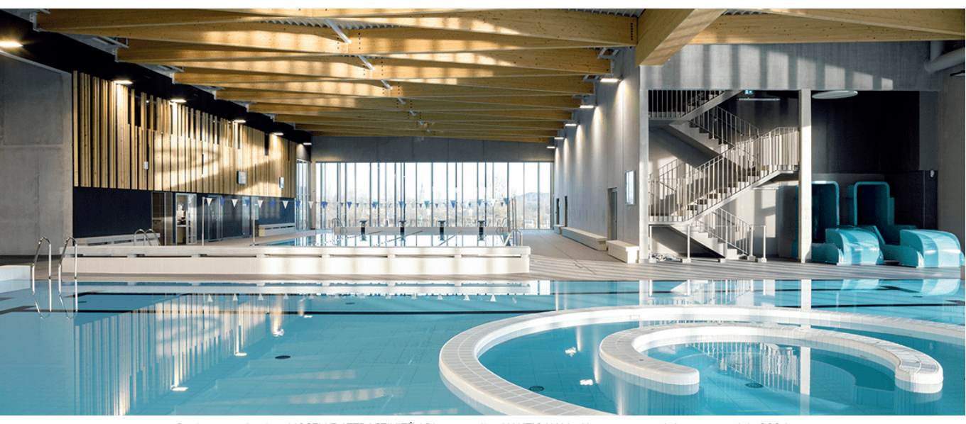
Design - production: MOSELLE ATTRACTIVITÉ / Photo credits: NAUTIC HAM - Non-contractual document - July 2024